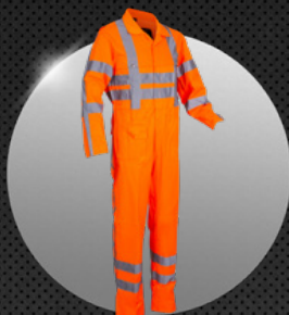
X-VIZ-ULTRA 5805 Art. no. 2.45.807.00