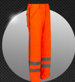
X-VIZ-STRONG 5825 Art. no. 2.45.827.00

OXXA ELIDA 2358 KNEE PADS Art. no. 2.12.358.02